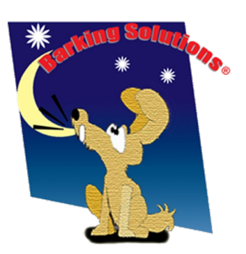
ISSUED BY BARKING SOLUTIONS

Because most people today buy a dog for protection as well as a companion, it is important that we understand the distinct differences between a good watchdog and a nuisance barker. Allowing your dog to bark at anything it likes is not the correct way to teach it to be a "good watch dog".